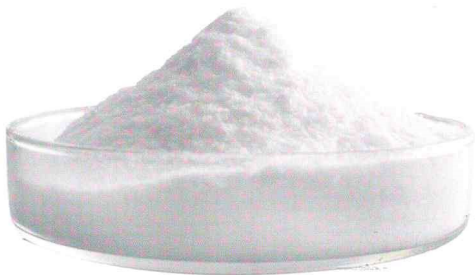
升华水杨酸 Sublimed Salicylic acid