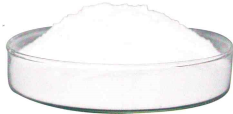
药用水杨酸 Pharma Salicylic acid