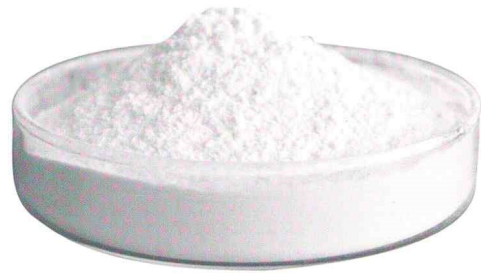
工业水杨酸 Technical Salicylic acid