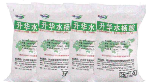
水杨酸 Salicylic acid